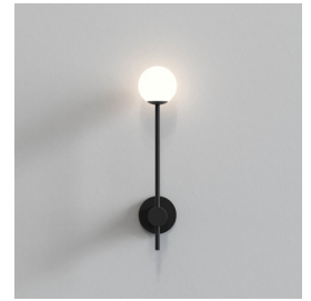
CODE: 1424004 FINISH: MATT BLACK

TO MAINTAIN THIS PRODUCT TO ITS BEST CONDITION, PLEASE VIEW OUR CARE AND CLEANING GUIDE ON THE SUPPORT SECTION OF THE ASTRO WEBSITE.