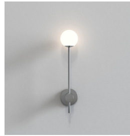
CODE: 1424002 FINISH: POLISHED CHROME